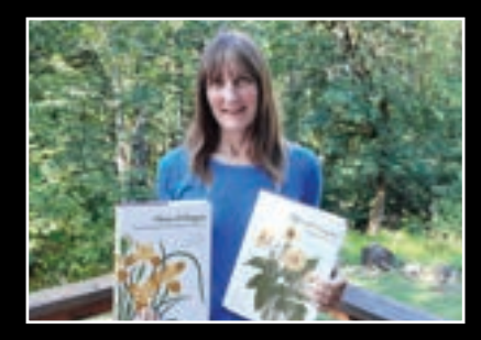
What Grows Here? Exploring Oregon's Plant Diversity

Registration opens April 6 (April 5 for members)