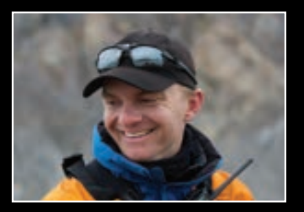
Chinstrap Penguins of Elephant Island

Thursday, April 21 Presentation: 5:30 to 6:30 p.m. Book signing: 6:30 to 8:00 p.m.