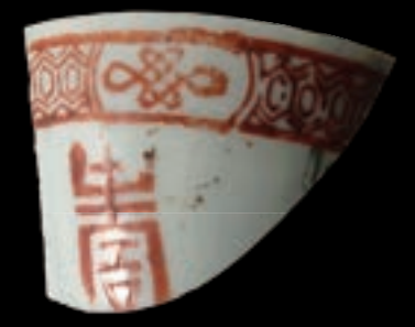
The Archaeology Of A Chinese Gift Store And Restaurant In Eugene's Market District

Registration opens May 4 (May 3 for members)