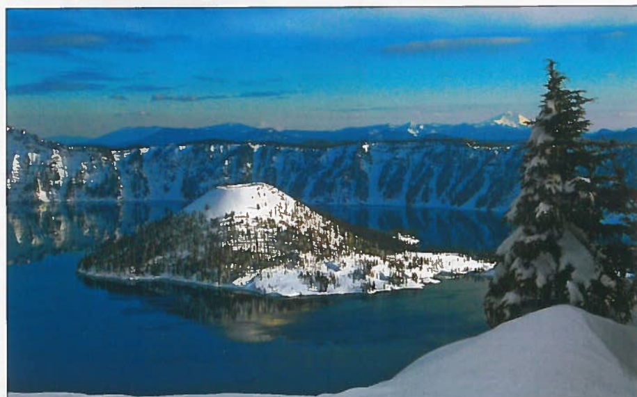
Where once stood Mount Mazama, a volcano 4,000 m high, now lies Crater Lake, the deepest (954 m) in the U.S. The feature in the middle of the lake, Wizard Island, was formed by a later, less-severe eruption.

Cressman, a scientist who refused to run with the pack, argued for very early human presence in the Great Basin. His vision was rewarded in 1938, when his team found several examples of sandals beneath a layer of Mazama ash in Fort