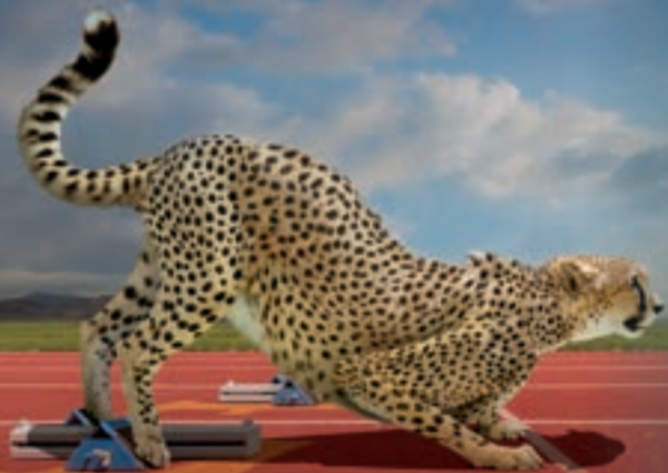
Exhibit on view through December 2022.

Hightail it to the Museum of Natural and Cultural History for a track & field competition like no other—with cheetahs, kangaroos, chimps, and other mammals all going for gold!