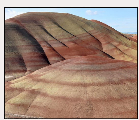
Some sedimentary rocks have layers that are easily visible, like the Painted Hills in Eastern Oregon.