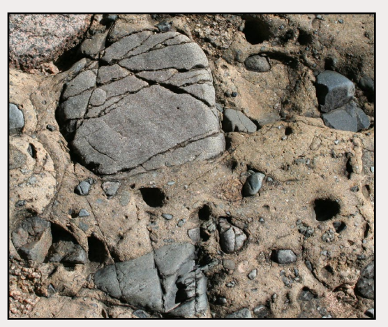
Conglomerate is a type of sedimentary rock that is a mix of fine sediment with larger pebbles.