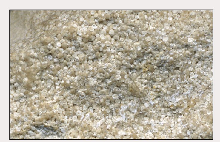
Some sedimentary rocks are made out of the remains of living material. Limestone is made from the remains of marine creatures.