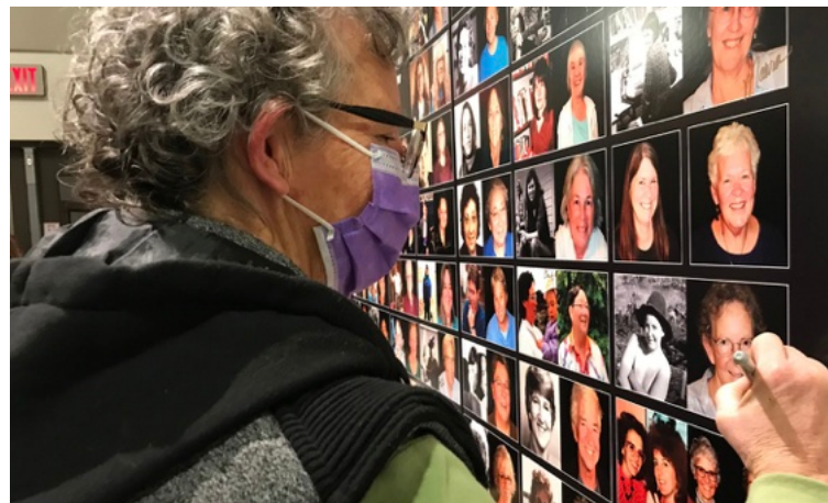
A museum guest signs a photo of herself in Outliers and Outlaws .