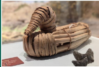
OREGON— WHERE PAST IS PRESENT