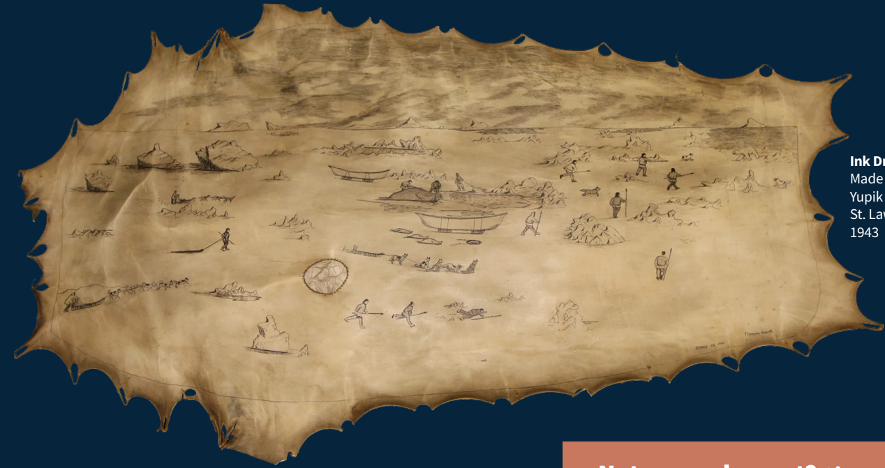
Ink Drawing on Seal Skin Made by Florence Napaaq Malewotkuk Yupik St. Lawrence Island, Alaska 1943

Included with regular admission; free for MNCH members and UO ID card holders. Show your Oregon Trail or other EBT card for an admission discount.