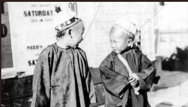
ROOTS AND RESILIENCE Chinese American Heritage in Oregon