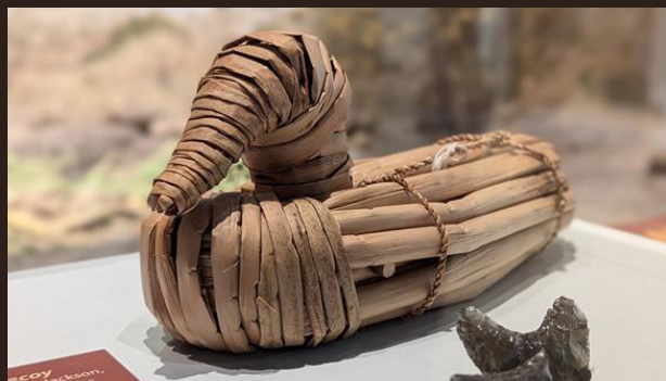
OREGON— WHERE PAST IS PRESENT