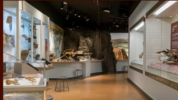
OREGON— WHERE PAST IS PRESENT