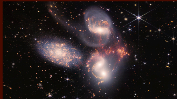
CAPTURING THE COSMOS Images from the James Webb Space Telescope