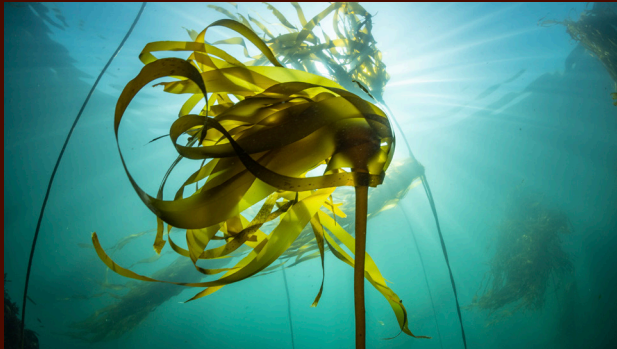
Underwater Forests Oregon's Kelp Ecosystems